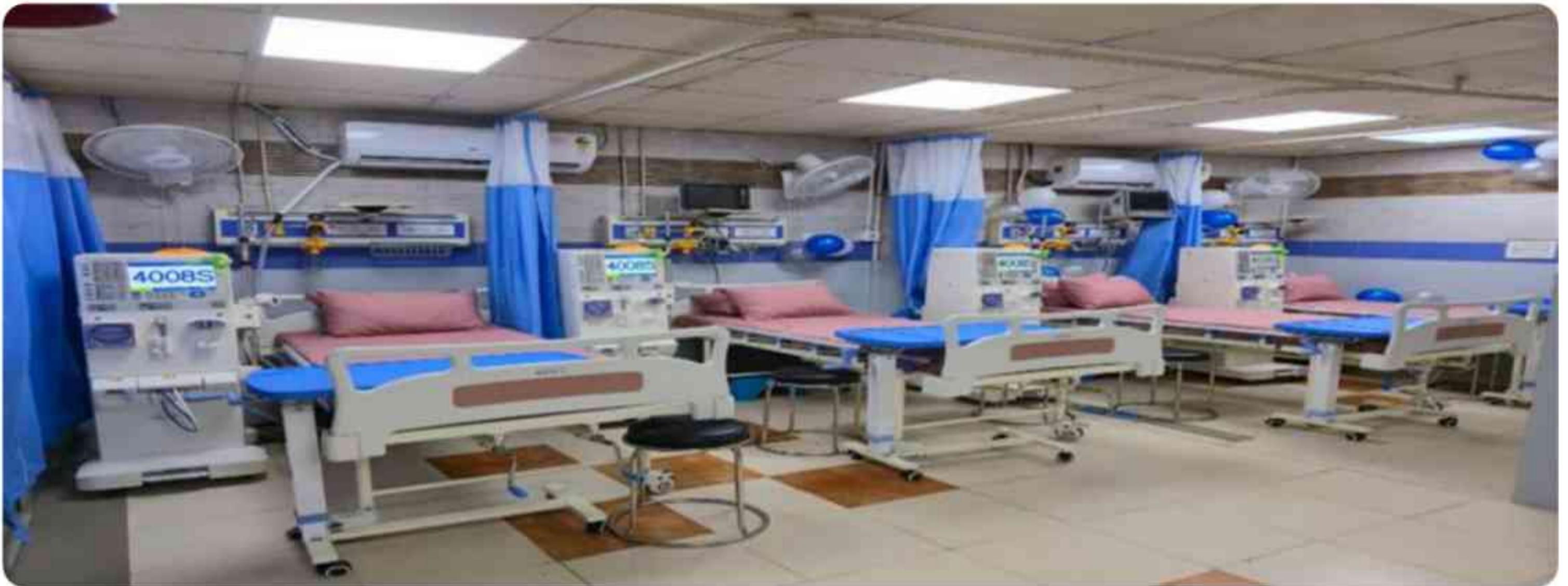
New Dialysis Center at AliGarh, Uttar Pradesh

$320,000 (twenty-eight million Rupees) are saved for the patients.